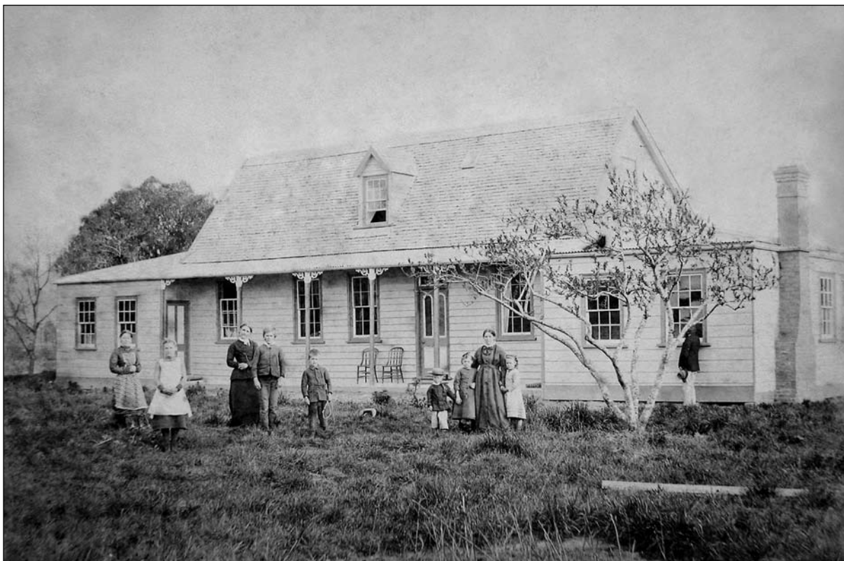
The Monrad family in front of the house at Karere. Olga is in the black dress with son Ditlev next to her. Viggo Monrad is in the background leaning against a window.