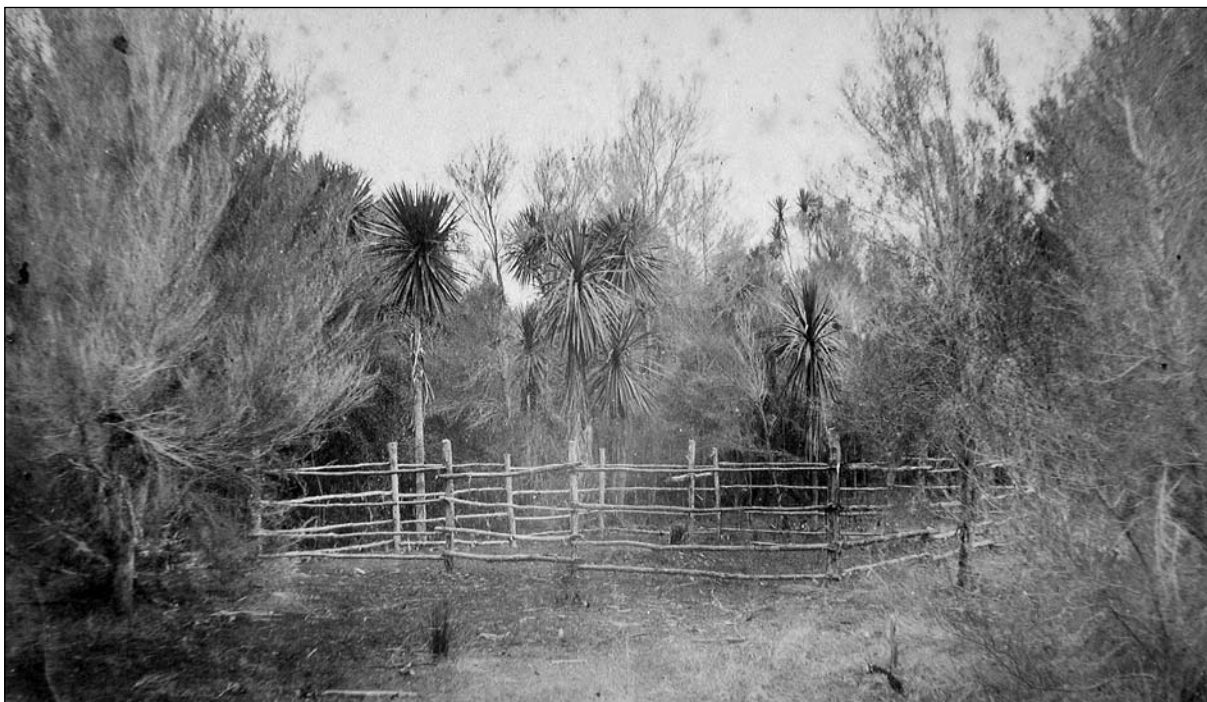
"The little enclosure where my boy is buried".