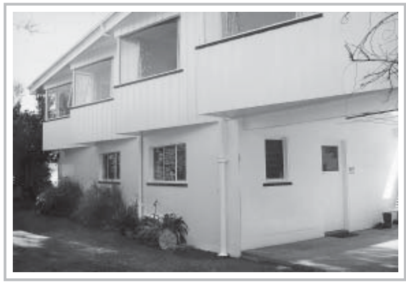
An imaginative treatment of the bedroom wing.