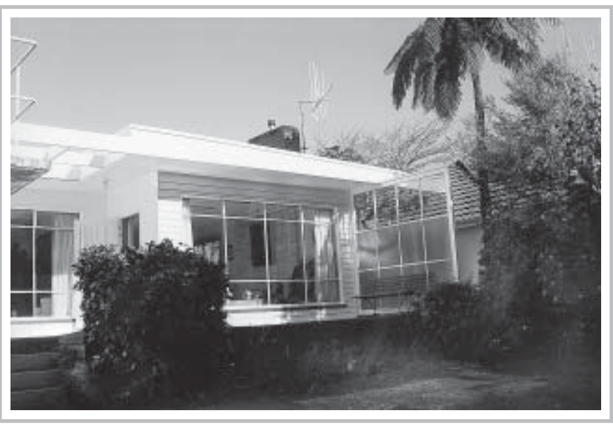
Large windows with metal frames and a terrace screen. McMillan house, Jickell St.

A light, open, uncluttered domestic environment was the achievement of the modern movement and influenced the design of the family home for the rest of the century.