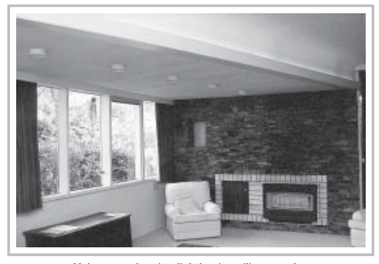
Main room showing lighting in ceiling panel.