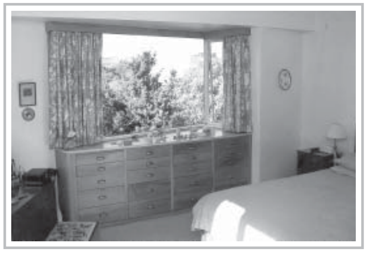
Built-in bedroom furniture in angled window. McMillan house, Jickell St.

Following World War II there was tremendous demand for homes for returned servicemen and a strong emphasis on family life. The modern movement was not only an architectural style but also involved a social vision. It promoted a new design for living based on the needs of the modern family. Women were no longer expected to work in inconvenient kitchens separated from family living - or in cold dismal washhouses. Kitchens and laundries became small but efficient working spaces with banks of cupboards and space for the new refrigerators and washing machines. Bookshelves, cabinets, chests of drawers and divans were all built-in to save space and eliminate dust.