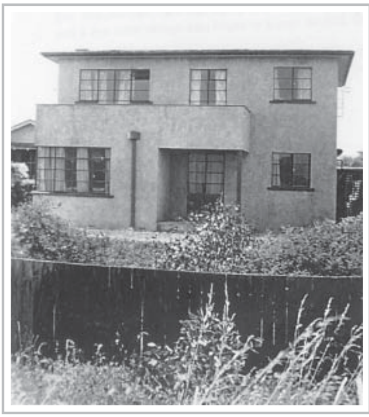
Mitchell holiday home, Paraparaumu, 1935.