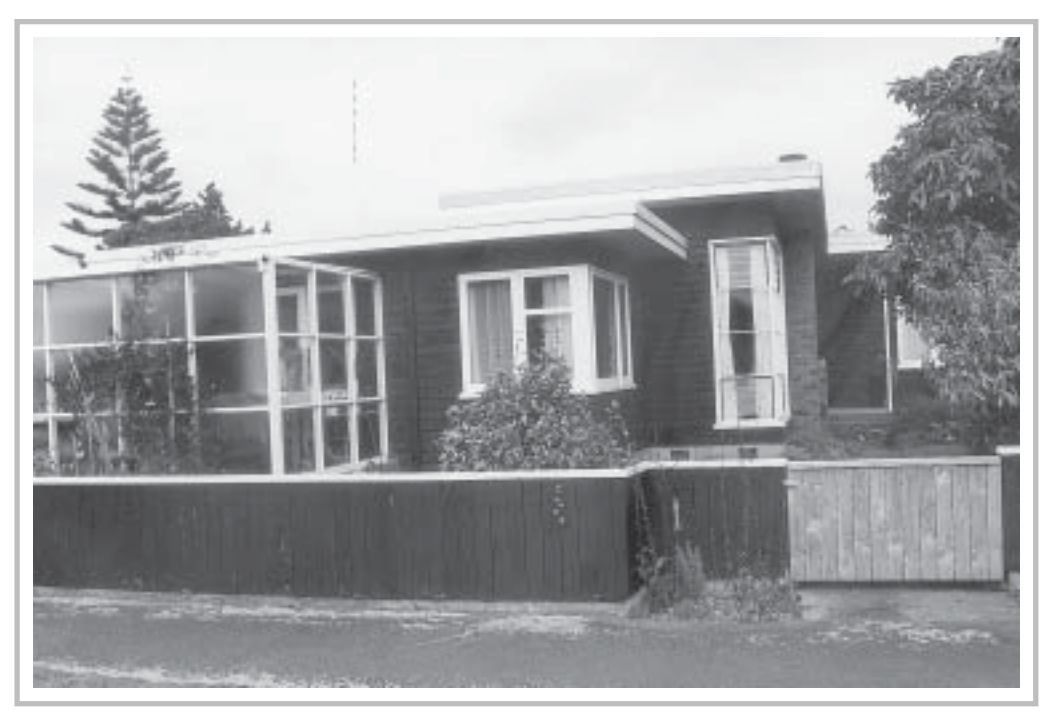
Weatherboards painted with creosote. Fife house, Hughes Ave.

Great attention was also given to the aesthetics of the exterior appearance. Writers in architectural journals ridiculed the riot of superficial ornament that they saw as characterising the Victorian and Edwardian periods. They hated decoration and described their designs as 'wholemeal bread' - as compared with iced cake. The exterior colours were generally subdued with brown-stained or creosoted weatherboard being favoured. The general effect was horizontal but rooms projecting or recessed to