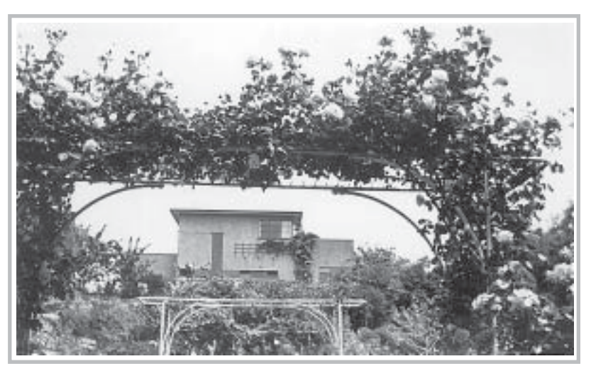
Hart house, Elmira Ave., about 1950.