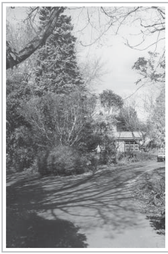
Rees house, Te Awe Awe St. in its mature garden setting. October 2000.