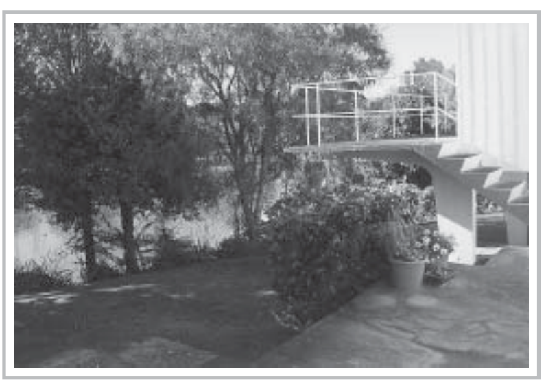
A terrace built on bold engineering principles.

The house has the effect of simplicity, light and space. It is both functional and visually satisfying and has remained almost unaltered. In this house Cox reveals his capacity to adapt the essential features of the modernist movement to local conditions.