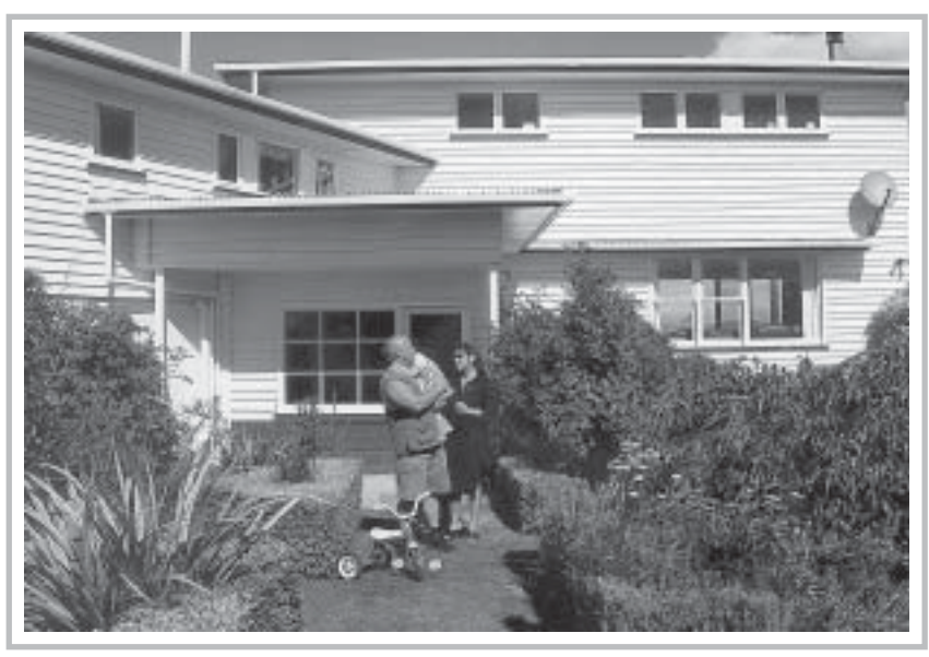
A new life for the house on a rural site. March, 2001.