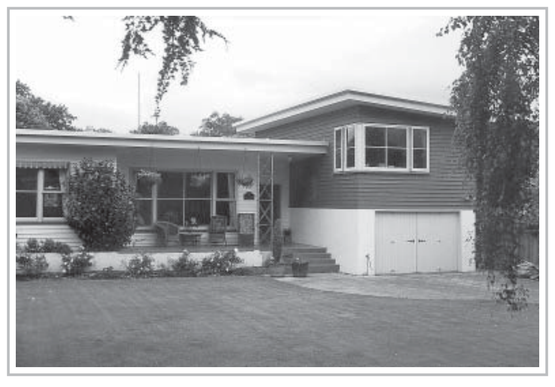
Split-level house with careful window treatment. Johns house, Hardie St.

In the fifties, groups of architects, particularly in Auckland and Wellington, set out on a crusade to change the taste of the New Zealand public. Exhibition homes were built and a welter of new magazines such as Home and Building offered plans and articles on the new style. Architects supported the general desire to modernise the building industry and reduce the cost of labour and materials. Concrete block construction and the use of pinus radiata for cladding were economical and at the same time reflected the modern design principles. The lowpitched roof they favoured required less support than the normal heavy tiled roof and in general they selected materials to create an effect as light and open as technically possible. The architects celebrated honesty, simplicity and truth and were critical of the Art Deco style, sometimes termed moderne or modernistic, because this styling merely concealed conventional building practices.