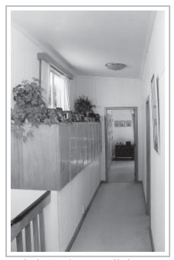
Ample storage in passage and bedrooms. McMillan house, Jickell St.

A feature of most styles at this period was the greatly increased size of windows. Windows were designed to provide good ventilation, light and heat - a forerunner of more recent ideas of passive solar heating. Large areas of glass with ventilation provided by louvers top and bottom were a common design. Rooms were frequently protected from the summer