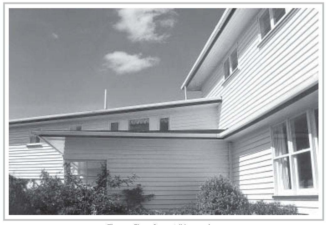
The rooflines form striking angles. Bodle house, Aranui Rd., Newbury.

allow for sun or view created a variety of angles and verticals. This produced subtle effects of light and shade and the phrase 'less is more' was in current use. These houses were not designed to impress by their 'street appeal' but were built in harmony with a particular site. Though building restrictions often required architects to design quite small houses, they hoped to convince people of the difference between the careful detail of the architect-designed house and the rectangular boxes of the group builders in the new suburbs.