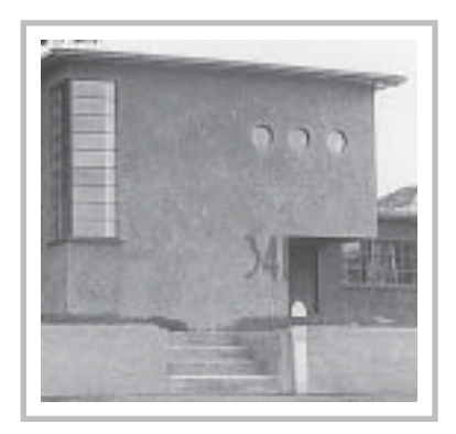
Cox home 1935 (detail). Cox family collection