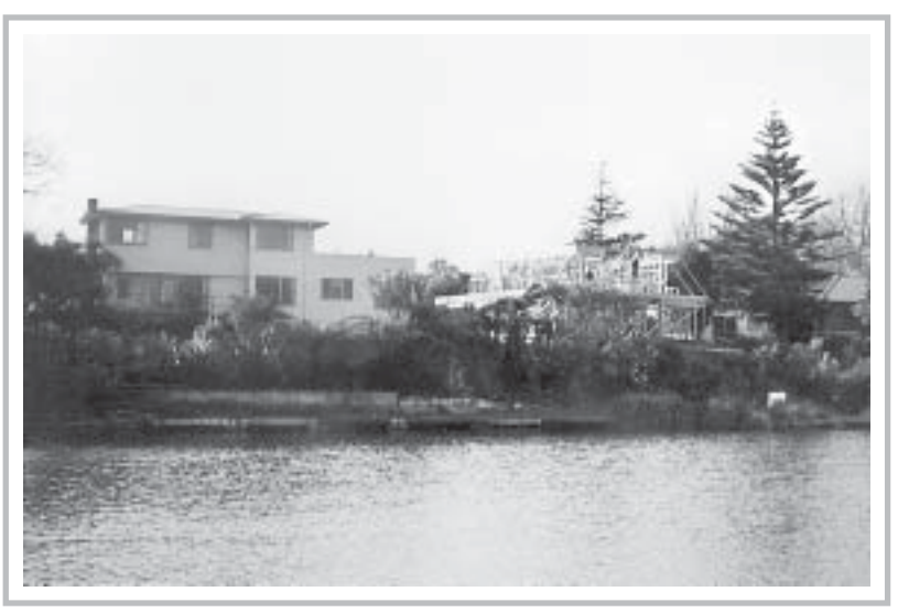
Bodle house, Ihaka St., on original site by the Hokowhitu Lagoon.

The houses designed by Cox are important. They are examples of modernism, a major twentieth century movement that revolutionised the way houses are designed and constructed and which expressed the social vision of the mid-twentieth century. They are also Palmerston North houses built by a local architect for local families and still, a half century later, afford great satisfaction to their present owners. They reflect our values and our culture, contain part of our history and contribute to the rich urban tapestry of the city. We hope that they will continue to be maintained and enjoyed for many years to come.