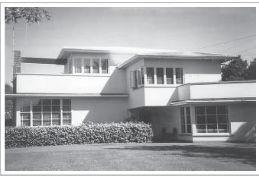
This house recalls the lines of some of Wright's 'prairie' houses. Rees house, Te Awe Awe St., 1947. Watt family photograph