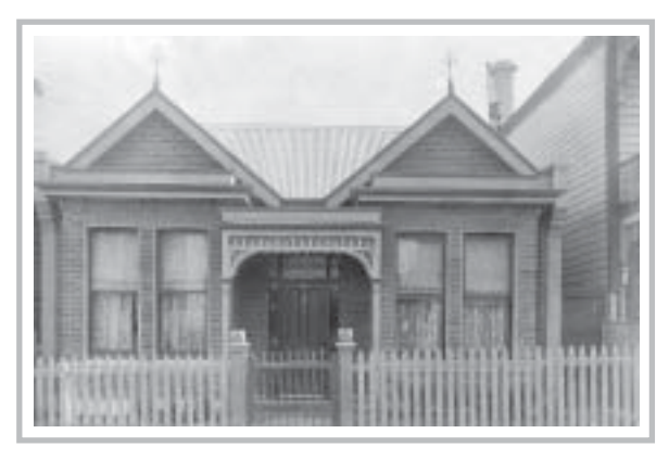
\begin{array}{c} \hbox{Childhood home, 689 Cumberland St., Dunedin.} \\ \hline \textit{Cox family collection} \end{array}