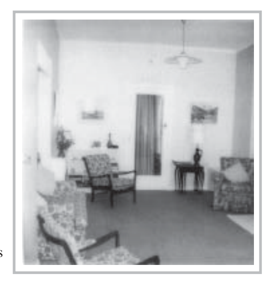
Contemporary Polaroid shots of interior furnishing.

Zoe Fife says, "We didn't have much money but we liked nice things." The flooring was native timber and initially covered by rugs and Foxton flax matting. Original paintings by a relative were displayed throughout the house. The plain curtains in the lounge, the off-white divan in the dining room and the blond oak dining suite were characteristic of good taste in the fifties. As a family member says, "It was modern then and still looks modern."